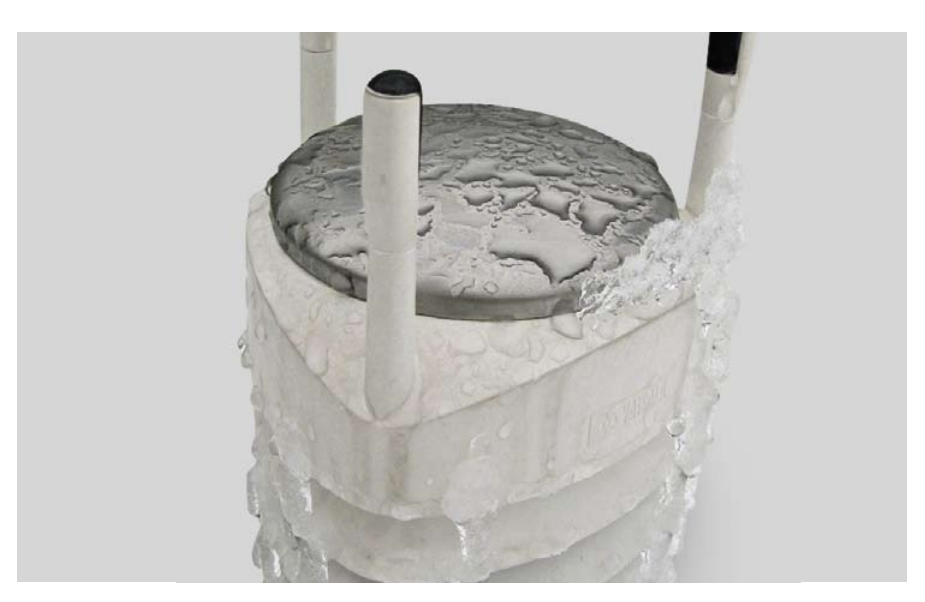
The WXT520 has an automatic control circuit that switches the heating on at low temperatures.