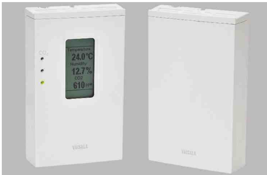
GMW90 Series Carbon Dioxide, Temperature and Humidity Transmitters for HVAC are available with either a display opening or a solid front. An optional traffic light indication can also be selected.

The Vaisala GMW90 Series CARBOCAP® Carbon Dioxide, Temperature, and Humidity Transmitters are based on new measurement technology for improved reliability and stability. With the new technology the transmitter's inspection interval is extended to five years.