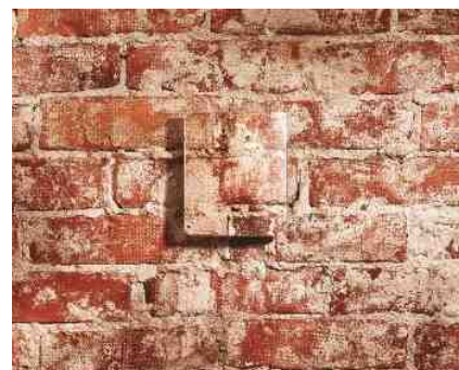
Make the transmitter blend into your interior design with the optional decorative cover.

exchangeable measurement modules. Sensor traceability and measurement quality is easily maintained by snapping on a new module calibrated at Vaisala factory. The instrument can also be calibrated using a hand-held meter or reference gas CO 2 bottle. The service interfaces are easy to reach by simply sliding the cover down. The closed cover keeps the measurement environment stable during calibration and ensures a top-quality final result.