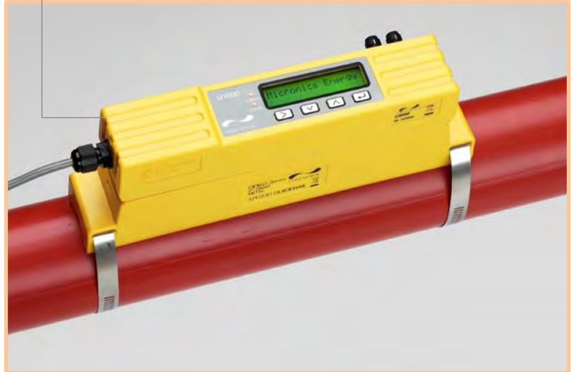
U1000 HM – Fixed Ultrasonic Heat/Energy Meter with Modbus Communication

Micronics reserve the right to alter any specification without notification.