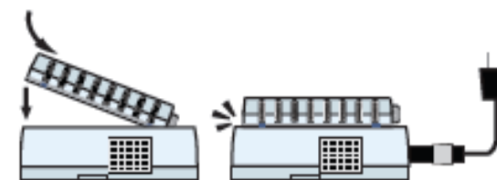
Figure 1 Connecting a Logger to a vNet Device