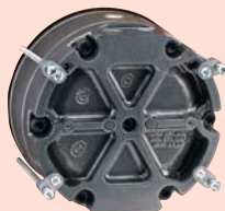
Back view shows flush mounting adapters.