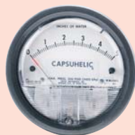
Flush mounted in panel.

Capsuhelic® gages may be flush mounted in a panel or surface mounted. Hardware is included for either. For flush mounting, a 4 13/16" diameter cutout in panel is required. Where high shock or vibration are problems, order optional A-496 Heavy Duty flush mount bracket. Optional A-610 kit provides simple means of attaching gage to 1 1/2"-2" horizontal or vertical pipe. Installation is same as Magnehelic® gage shown on page 5. All standard models are calibrated for vertical mounting. Gages with ranges above 5 in. w.c. can be factory calibrated for horizontal or inclined mounting on special order.