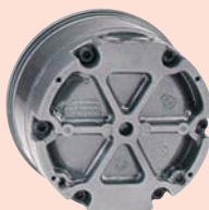
Back view for surface mounting.