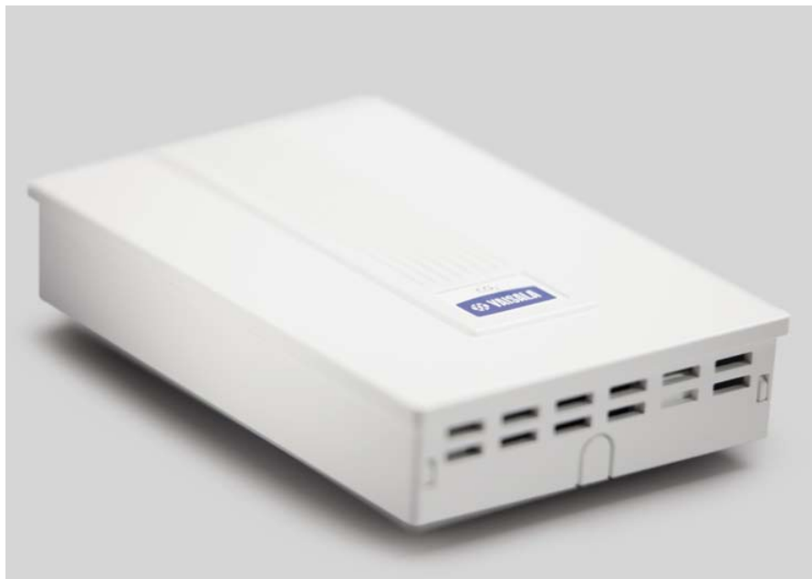
The Vaisala CARBOCAP® Carbon Dioxide Transmitter GMW115 is a wall-mounted CO 2 transmitter for demand-controlled ventilation.