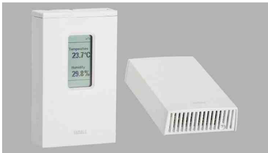
The HMW90 Series Humidity and Temperature Transmitters are designed for demanding HVAC applications.

Wall-mounted Vaisala HMW90 Series HUMICAP® Humidity and Temperature Transmitters measure relative humidity and temperature in indoor HVAC applications, where high accuracy, stability, and reliable operation are required.