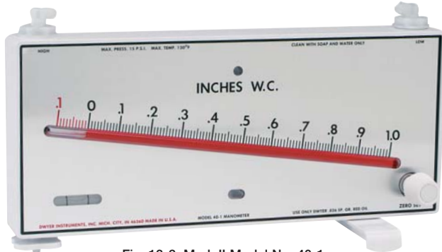
Fig. 13-2, Mark II Model No. 40-1 inclined manometer

Dwyer Mark II series molded manometers are of the inclined and inclined-vertical types. The curved inclined-vertical tube of the Model 25 gage provides higher ranges with more easily read increments at low readings. The Model 25 is excellent for general purpose work. The Model 40 inclined gage provides linear calibration and excellent resolution throughout its range. The Model 40 is ideally suited for air velocity and air filter gage applications. Both gage types are capable of pressure measurements above and below atmospheric as well as differential pressure measurements.