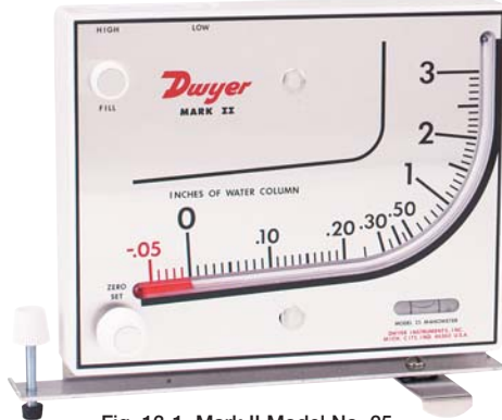
Fig. 13-1, Mark II Model No. 25 inclined-vertical manometer. (shown with optional A-612 portable stand)