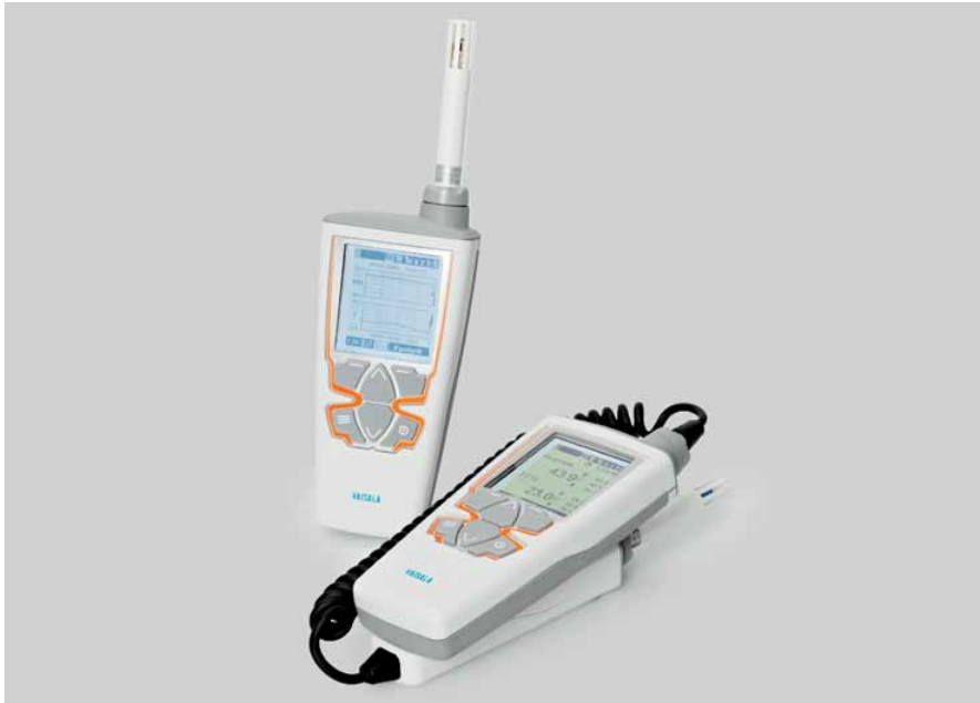
The HM40 Humidity Meter can be chosen either in standard or remote probe version.

The HM40 is a compact and portable humidity meter at hand everywhere you go. It is an ideal spotchecking tool that is easy to use and provides reliable measurement. It can be used for a wide range of various portable measurement applications. According to a user's needs, the meter is available in two models: standard and with a remote probe.